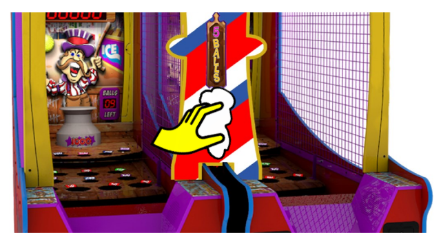
Step 4: Wipe all balls and LET AIR DRY BEFORE RETURNING TO THE GAME.